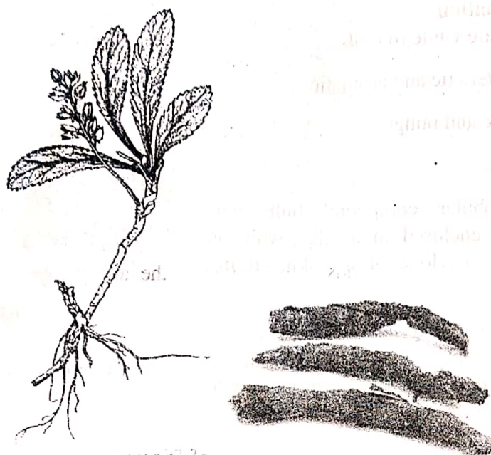
(a) Picrorrhiza Twig (b) Rhizomes of Picrorrhiza