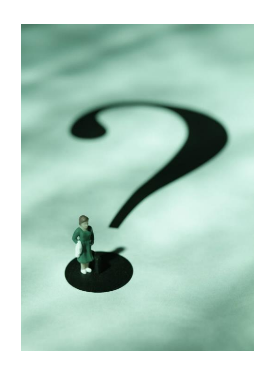
Any questions please?