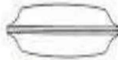
1) Wet Seal