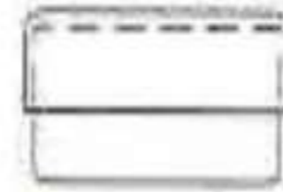
2) Dry Seal (without dome)