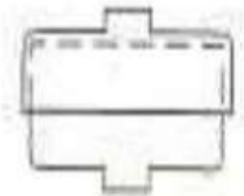
3) Dry Seal (with dome)