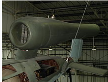
Argus As 014 pulsejet engine of a V-1 flying bomb at the Royal Air Force Museum London

In 1934, Georg Madelung and Munich-based Paul Schmidt proposed to the German Air Ministry a "flying bomb" powered by Schmidt's pulsejet. Madelung co-invented the ribbon parachute , a device used to stabilise the V-1 in its terminal dive. [ citation needed ] Schmidt's prototype bomb failed to meet German Air Ministry specifications, especially owing to poor accuracy, range and high cost. The original Schmidt design had the pulsejet placed in a fuselage like a modern jet fighter, unlike the eventual V-1, which had the engine placed above the warhead and fuselage.