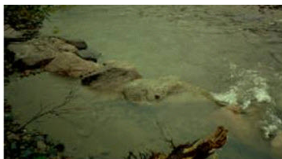
Fig. 12.9. Rock Vanes for Protection of Stream Bank.

Keywords: Bank Erosion, Impacts, Control Measures, Stabilize Eroding Banks