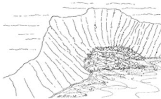
Fig. 12.3. Slumping is a Common Type of Mass Failure.

Mass failure describes the various mechanisms of bank erosion that result in sections of the bank sliding or toppling into the stream. Mass failure is sometimes described as collapse or slumping (Fig. 12.3). Bare and near-vertical banks or areas of slumped bank materials are obvious signs of these processes. The causes of these types of failures are often difficult to determine but can include natural and/or human factors.