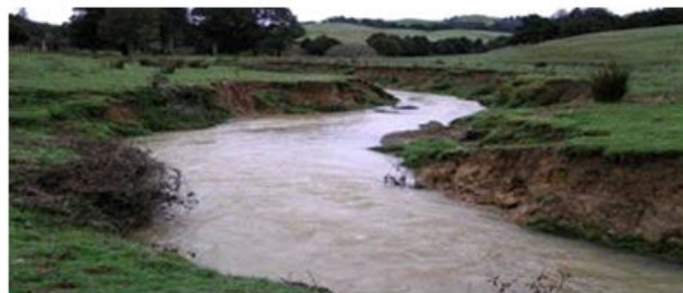
Fig. 12.1. Stream Bank Erosion Showing Slump and Meandering.

Streams are generally subject to wide fluctuations in both flow depth and velocity over a period of years due to normal seasonal changes in rainfall and large single-storm events. As the flow depths and velocities increase, the force of the water flowing against the stream bank removes soil particles from the banks, and in many cases erosion causes banks to slump and fall into the flowing water. A typical stream bank erosion is shown in Fig. 12.1. In extreme situations where high flows persist over long periods, banks may erode several feet annually. Rain falling on stream banks or runoff from adjacent fields that enters a stream by flowing over the stream banks can also erode soil from the banks, particularly if banks are inadequately protected. Finally, water discharged into a stream from tributary drainage systems (such as waterways or tile lines) can also erode stream banks, particularly if the water is discharged in an area where the bank is unstable and highly erodible. In many cases, moving the outlet to a point where the stream is less erodible or stabilizing the outlet area with rock can alleviate this problem.