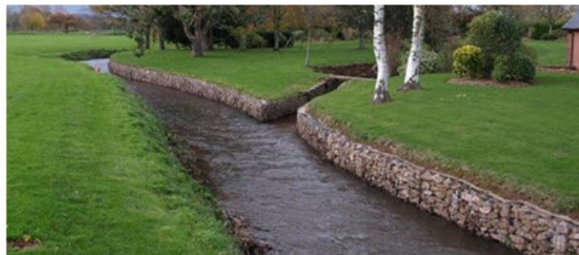
Fig. 12.6. Use of Gabions for Protecting the Stream Bank from Erosion. (Source: http://www.gabion1.com.au/gabion_erosion_control.htm )

Gabions are rectangular galvanized wire baskets filled with stones used as pervious, semi flexible building blocks for slope and channel stabilization (Fig. 12.6). Live rooting branches may be placed between the rock-filled baskets. Gabions are generally used where flow velocities are too high for riprap of small stones or the surface to be protected has a very steep slope.