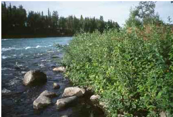
Fig. 12.7. Bio-engineering Practices to Stabilize Eroding Banks Native Material Revetments.

These practices use native materials, wood and stone to armor stream banks and deflect flow away from them. Low rock walls and log crib-walls can be used to armor the bank. Rootwads armor the bank and provide protection downstream by deflecting the flow away from the bank (Fig. 12.8). Rock and logs can be used to construct a variety of structures that stabilize the streambed and banks. Cross vanes are rock structures that stabilize the streambed while aiding in stream bank stabilization. Rock or log vanes redirect stream flow away from the toe of the stream bank and help to stabilize the bank upstream and downstream from the structure (Fig. 12.9).