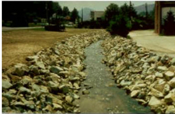
Fig. 12.5. Riprap for Protection of River Bank.