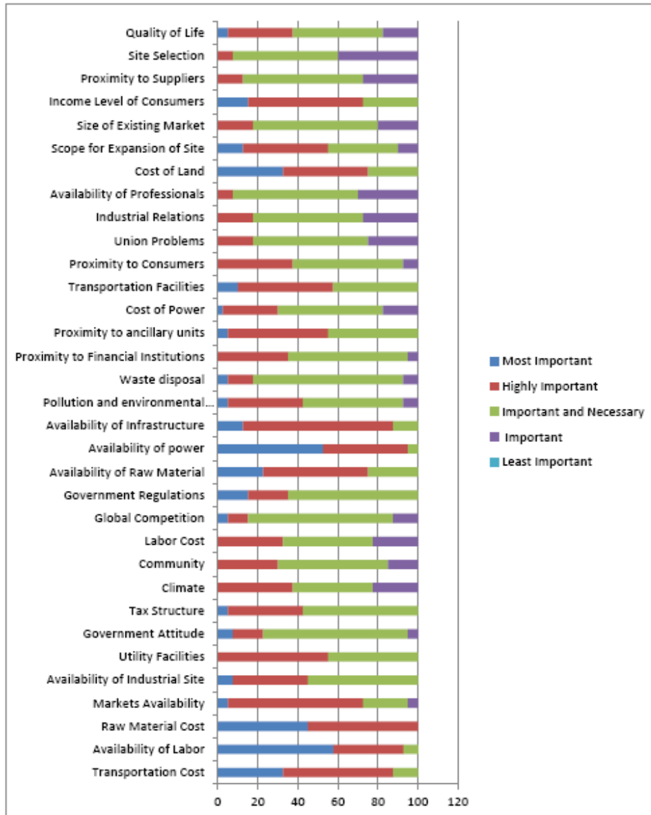
Figure 1 Chart showing the importance of factors on the basis of rating scale (see online version for colours)