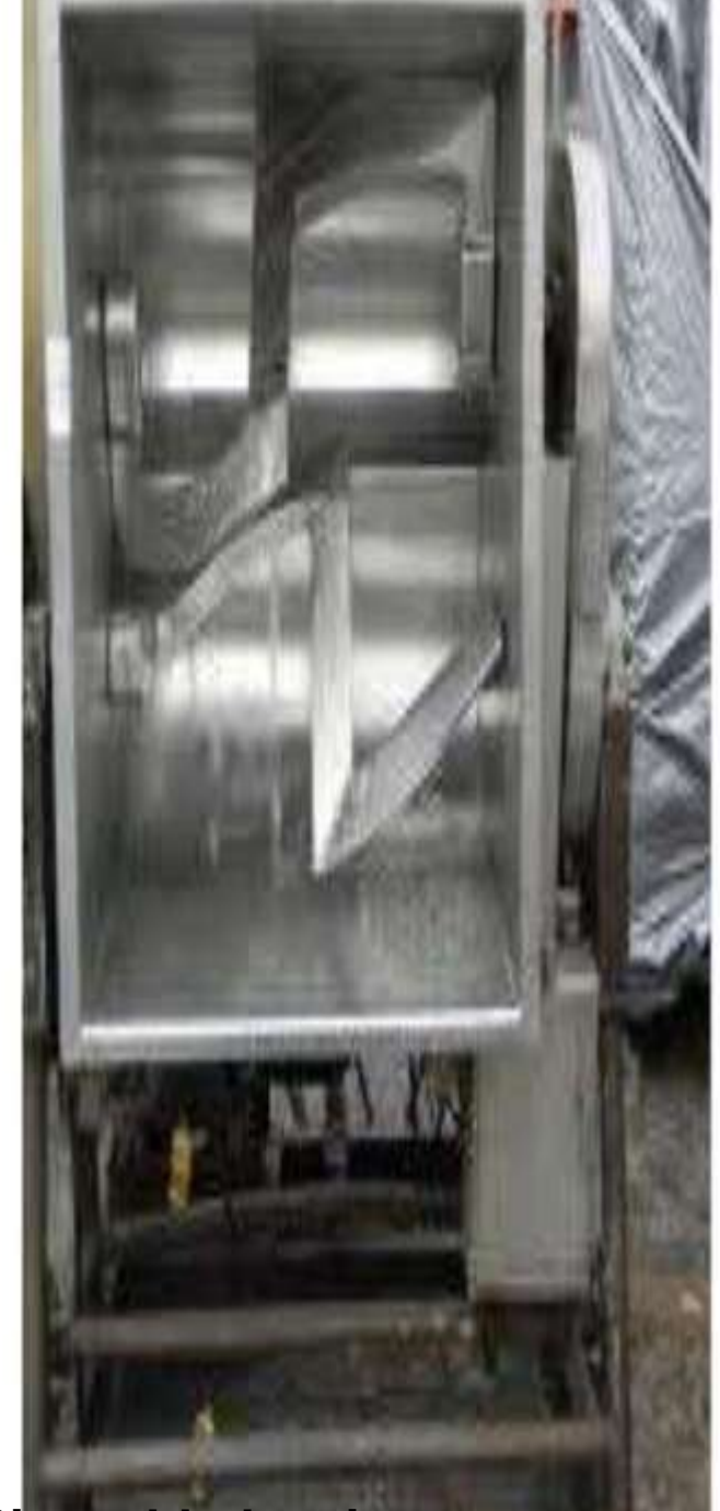
Sigma blade mixer