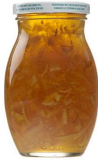
Fig. 18.3 Photograph of packaged marmalade

The specific requirements are as follows: