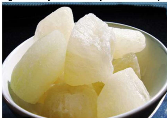
Fig. 20.1 Dry petha from ash gourd

For candying, bring the whole mass of petha and syrup to a boil and while still hot, drain the syrup. Roll the drained pieces in finely powdered sugar and dry them on trays at room temperature.