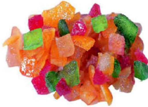
Fig. 20.2 Glazed fruit

In this case syrup of 70°Brix is employed. It is placed in a large deep vessel and allowed to cool to room temperature. To avoid premature granulation of sugar, a sheet of waxed paper is placed on the surface of the syrup. The candied fruit is placed on a wire mesh tray, which in turn is placed in a deep vessel. The cooled syrup is then gently poured over the fruit so as to cover it entirely. To prevent the fruit from floating, another wire-mesh tray is placed on it and a sheet of waxed paper is placed on the surface of the syrup. The whole mass is left undisturbed for 12-18 h, at the end of which a thin crust of crystallized sugar is formed. The tray containing the fruit is then removed carefully from the pan, and the surplus syrup drained off. The drained fruit are spread in a single layer on wire mesh trays and allowed to dry at room temperature or in driers at about 49°C.