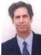
Noel N. Tata

Noel Tata is an influential figure in one of India's largest business conglomerates, the Tata Group. After beginning his career at Tata International, the group's arm for the products and services it offered abroad, Tata joined Trent, Tata Group's retail arm, of which he became managing director in 1999. Praised as an intelligent and candid businessperson, Tata earned his reputation largely by developing Trent's department store, Westside, from a single unprofitable shop to a chain of fourteen highly successful outlets. He was one of the favourites to assume the Tata Group's top post of group chairperson after the retirement of his half brother, Rattan Tata.