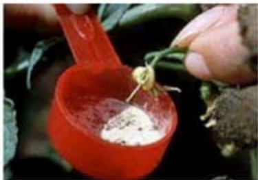
Dusting of pollen grain on emasculated flower