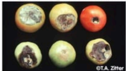
Blossom end rot