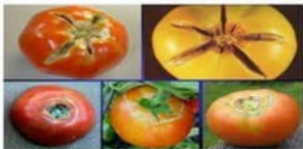
Figure 3. Growth cracks of tomato.