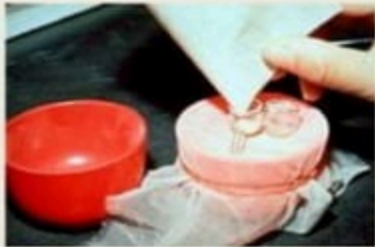
Collection of pollen