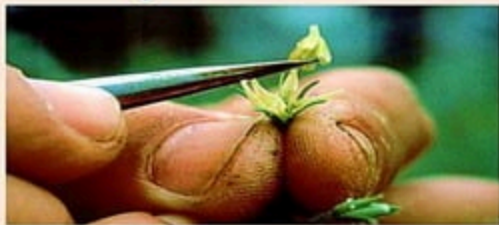
Removal of anther cone