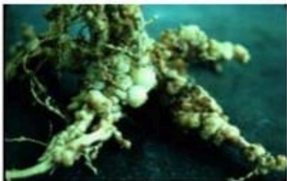
Severe symptoms of root knot nematode on tomato roots