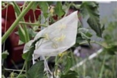
Bagging of pollinated flower to avoid contamination with foreign pollen