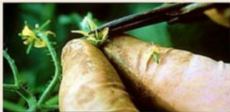
Cutting of petals