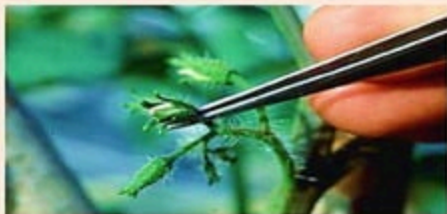
Selection of bud

Emasculation: Can be performed at the start of flowering, about 55-65 days after sowing.