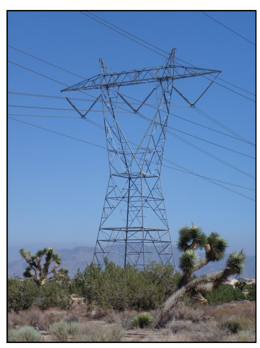
Example of a 500-kV single-circuit LST.