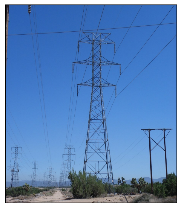
Example of a 220-kV double-circuit LST.

Structure sizes vary depending on voltage, topography, span length, and tower type. For example, double-circuit 500-kV LSTs generally range from 150 to over 200 feet tall, and single-circuit 500-kV towers generally range from 80 to 200 feet tall. Double-circuit structures are taller than single-circuit structures because the phases are arranged vertically and the lowest phase must maintain a minimum ground clearance, while the phases are arranged horizontally on single-circuit structures. As voltage increases, the phases must be separated by more distance to prevent any chance of interference or arcing. Thus, higher voltage towers and poles are taller and have wider horizontal cross arms than lower voltage structures.