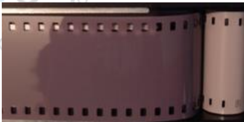
Fig-2: Showing Black And White Film (135)