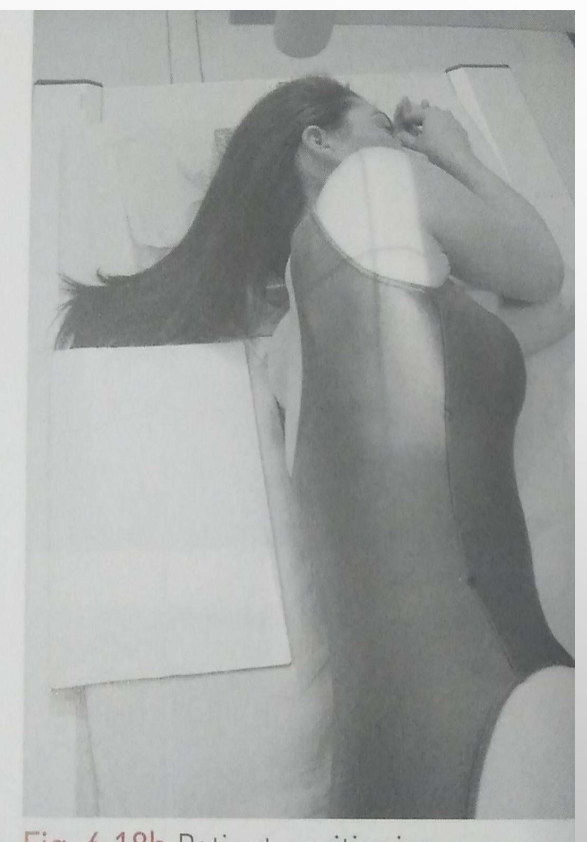
Fig. 6.18b Patient positioning.