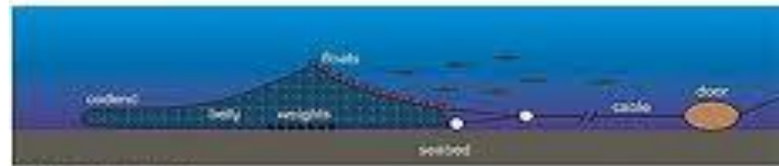
(after Missaleh et al., 1991)