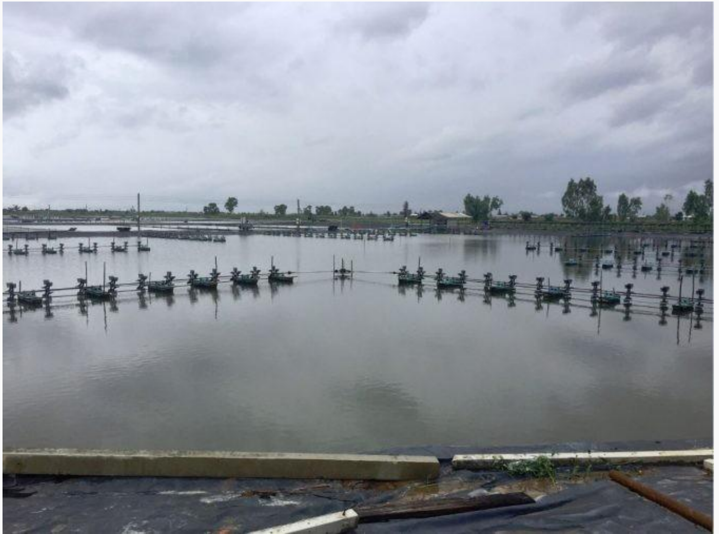
View of a grow-out shrimp pond implementing the Aquamimicry production approach.

Technology has been met with success worldwide by balancing natural plankton