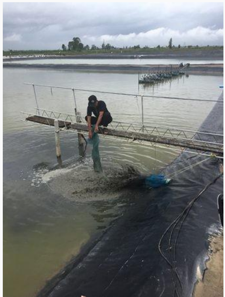
Draining effluent from a central drain in the growout pond to a sedimentation pond two hours after feeding the shrimp.

Currently the ratio of these ponds is 1:1 (treatment to growout ponds), which obviously requires relatively large areas of land in relation to production. However, trials are currently underway to substantially reduce this ratio by adjusting water flows, carbon inputs and different combinations of live organisms in the treatment ponds.