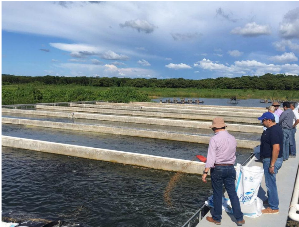
View of the some of the raceways in operation.