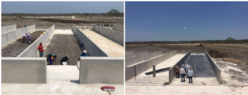
View of raceway construction for the demonstration project.

The system, built as a fixed floor project (not a floating model), was installed on a poured concrete wall footing with pond liner bottoms, and consists of seven raceways (cells), each with dimensions 5.0 m x 25 m x 1.20 m (150 cubic meter raceway volume) with a freeboard of 0.30 m. The total culture area of the raceways for holding and growing fish is 875 m 2 (1050 m 2 ), which represents 3.4 percent of the total surface area of the production pond. The raceways are equipped with five regenerative blowers providing 2.15 horsepower (60 Hz) per raceway. Additionally, the pond has Asian-style paddlewheels installed in the open water area, which helps mix and circulate water around the pond.