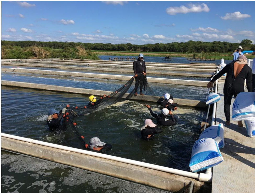
Harvesting tilapia from one of the raceways.

The second group of results includes raceways 1, 2, and 5. These raceways were stocked with 17,037 \pm 317 3 fish per raceway, with an individual average weight of 17.9 \pm 0.8 grams and average biomass at stocking of 2.03 \pm 0.06 kg/m 3 of raceway volume. These raceways were harvested after 116 days (raceways 1 and 2) and 132 days (raceway 5), respectively, with a final biomass of 56.9 \pm 3.3 kg/m 3 of the raceway. The average specific growth rate for this group was 2.88 \pm 0.14 percent gain/day.