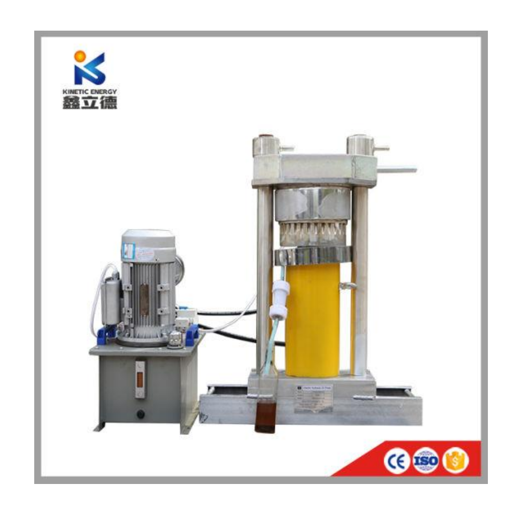
Machine operated cold press