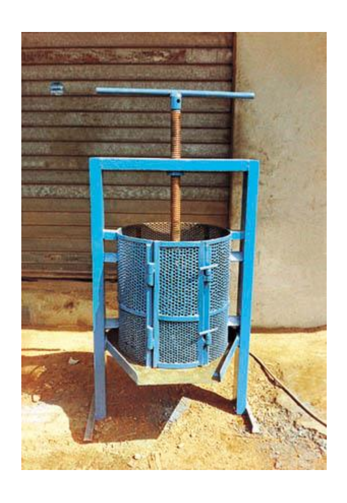
Hand operated palm oil extractor