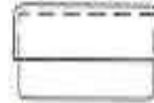
2) Dry Seal (without dome)