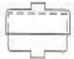
3) Dry Seal (with dome)