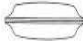
1) Wet Seal