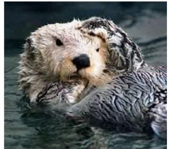
Marine birds and otters