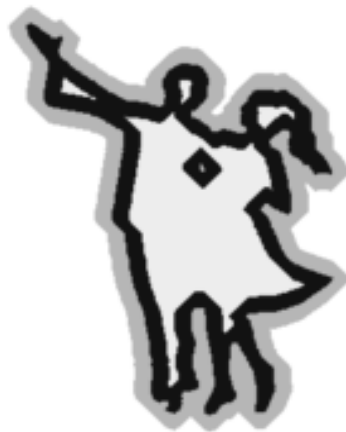
Figure 4. A shape (in black) and its morphological dilation (in grey) and erosion (in white) by a diamond-shape structuring element.

Microscope image processing is a broad term that covers the use of digital image processing techniques to process, analyze and present images obtained from a microscope. Such processing is now commonplace in a number of diverse fields such as medicine, biological research, cancer research, drug testing, metallurgy, etc. A number of manufacturers of microscopes now specifically design in features that allow the microscopes to interface to an image processing system.