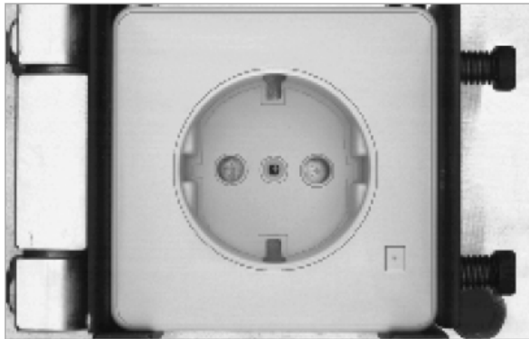
Figure 1. Digital image processing is used to verify the dimensional accuracy and examine the surface for inclusion and defects.

The set of things one can do in a mere 50 instructions is rather limited. On top of this many digital image processing applications are constrained by severe cost targets. Thus we often face the engineer's dreaded triple curse, the need to design something good, fast, and cheap all at once. [3]