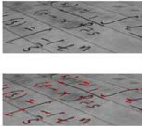
Figure 2. Output of a typical corner detection algorithm

In computer vision and image processing the concept of feature detection refers to methods that aim at computing abstractions of image information and making local decisions at every image point whether there is an image feature of a given type at that point or not. The resulting features will be subsets of the image domain, often in the form of isolated points, continuous curves or connected regions. [7]