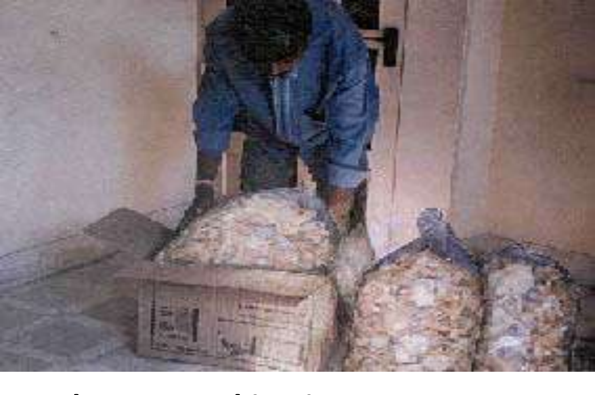
Mushroom packing in cartons