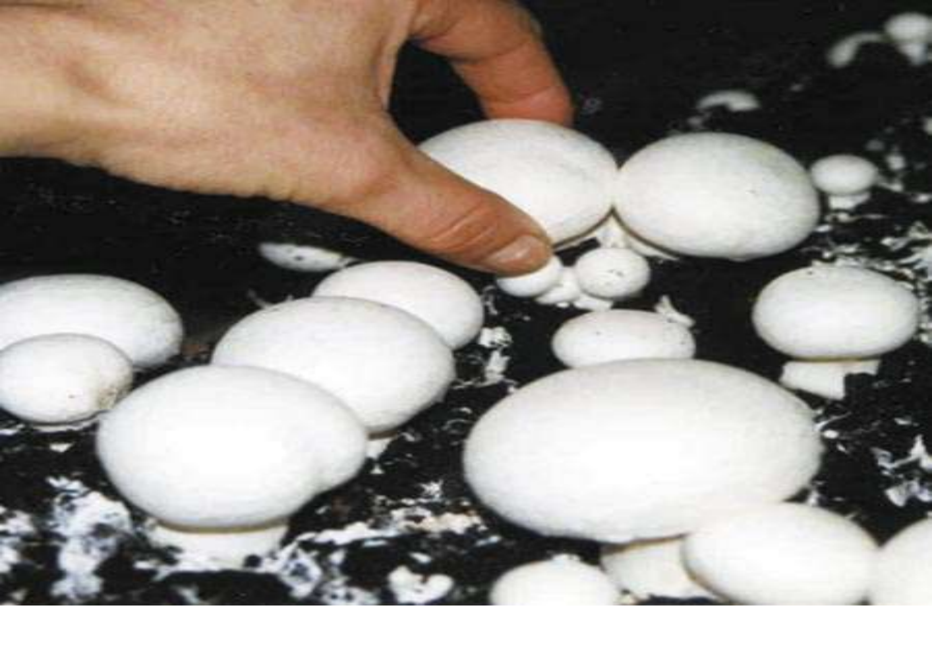
Harvesting of button mushrooms