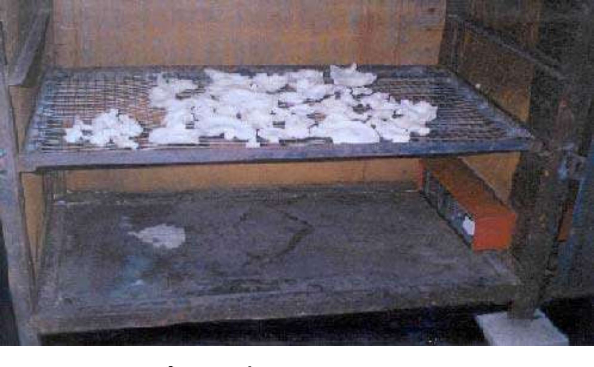
Drying of mushroom