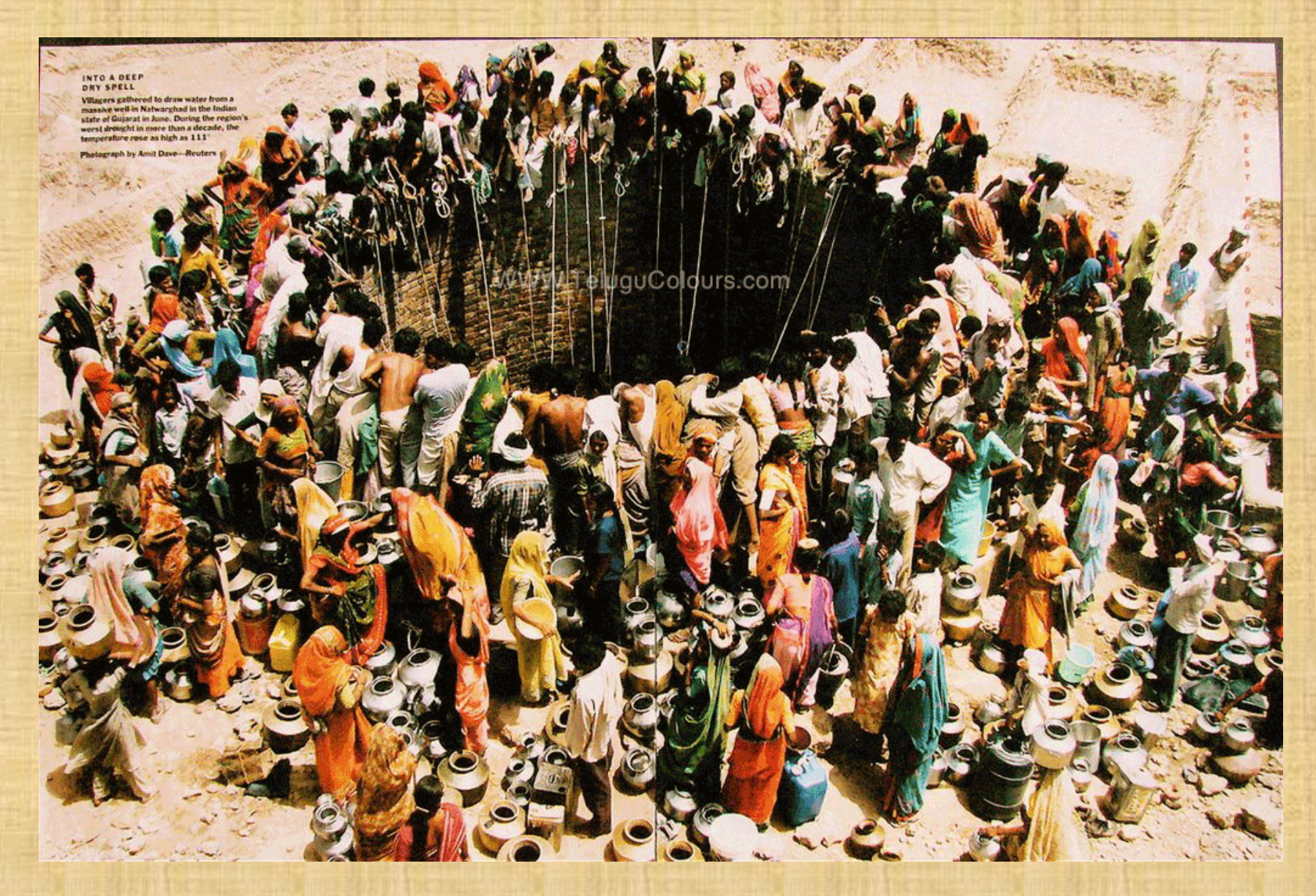
Projection of consequences in future due to over-exploitation of ground water & surface water