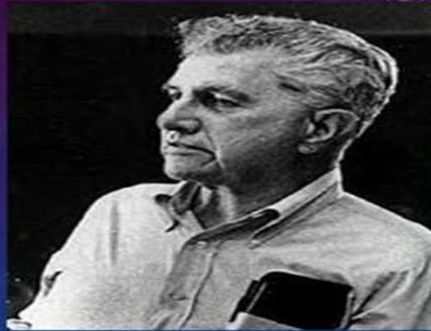
Merton Howard Miller (May 16, 1923 – June 3, 2000)