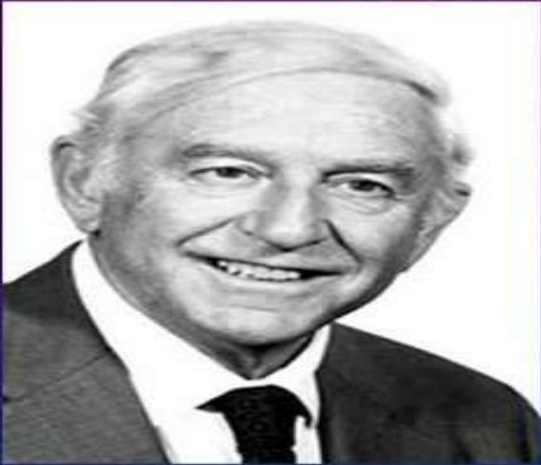
Franco Modigliani (June 18, 1918 – September 25, 2003)

Namaste beta.. hum hain Modigliani and Miller