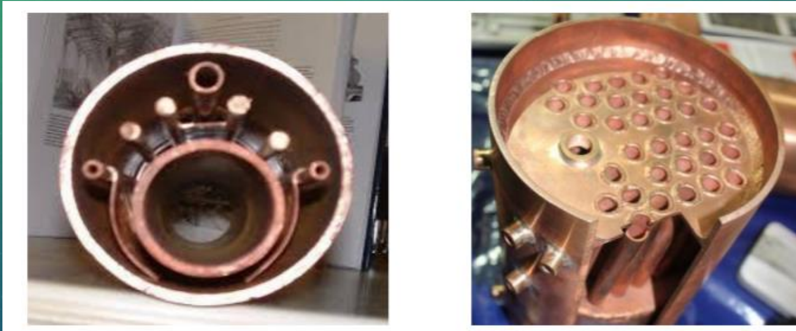
CUT SECTION OF SHELL