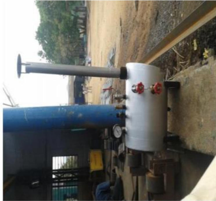
4 FINAL VIEW OF DESIGN AND FABRICATION OF PRESSING STEAM BOILER