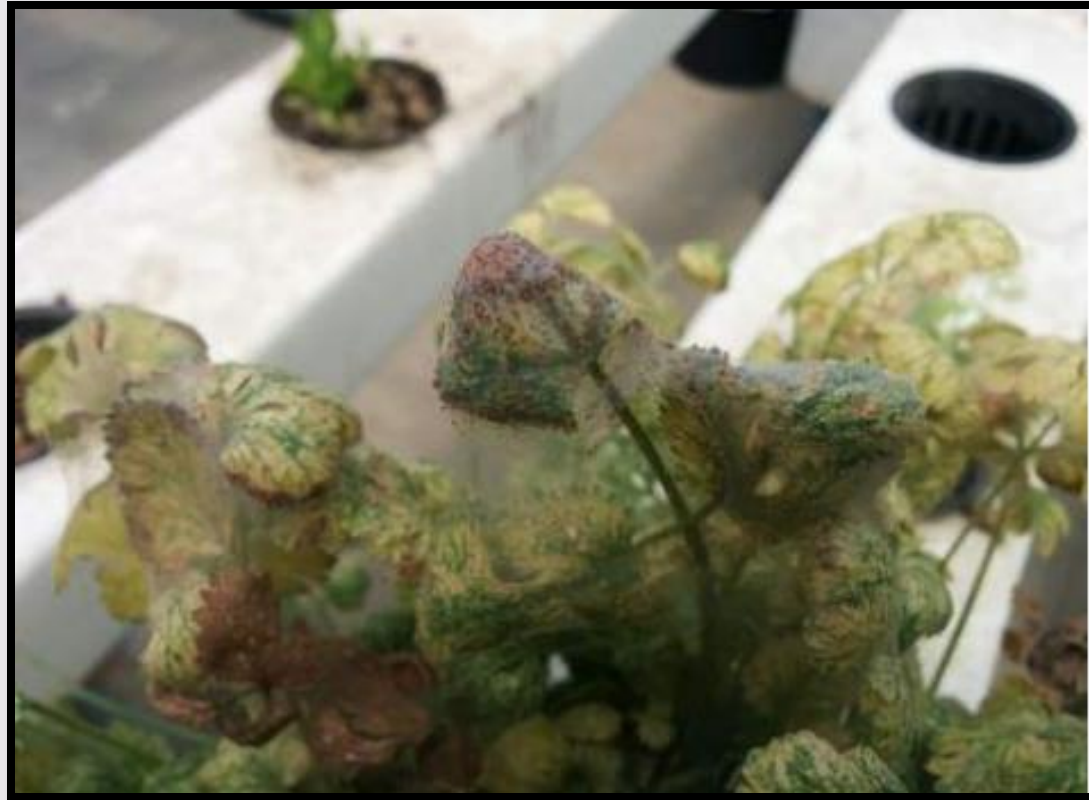
Attack of Spider Mites on coriander