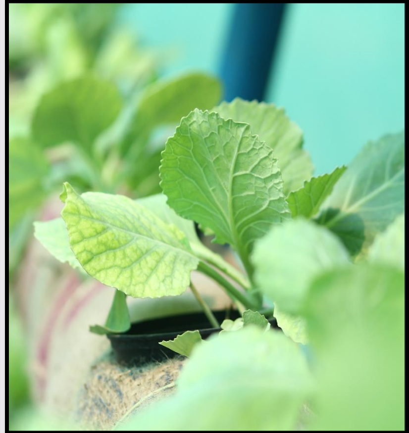
Interveinal chlorosis on cabbage leaves