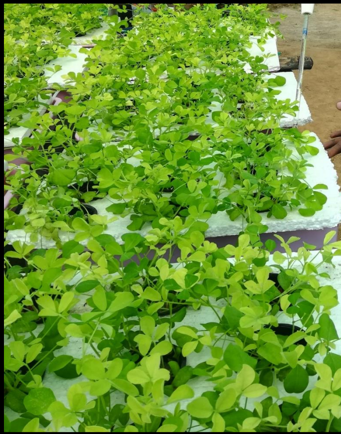
Chlorosis on fenugreek leaves