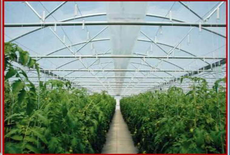
Greenhouse with steel structure