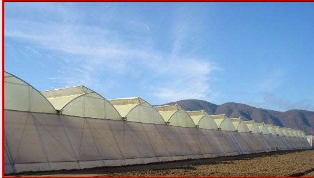
Polyvinyl chloride film (pvc films)