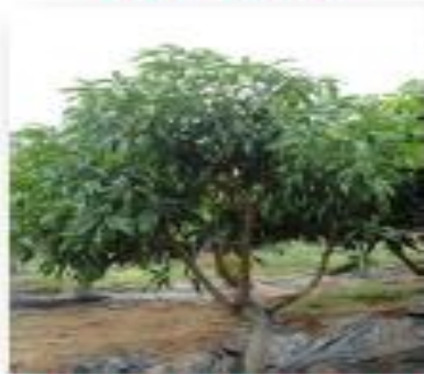
Fourth and final stage