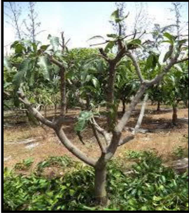
First pruning after harvest