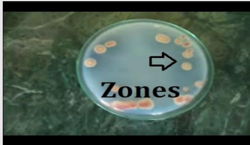
Fig: Biofertilizer colony

A biofertilizer is a substance which contains living micro-organisms which, when applied to seeds, plant surfaces, or soil, colonize the rhizosphere or the interior of the plant and promotes growth by increasing the supply or availability of primary nutrients to the host plant.