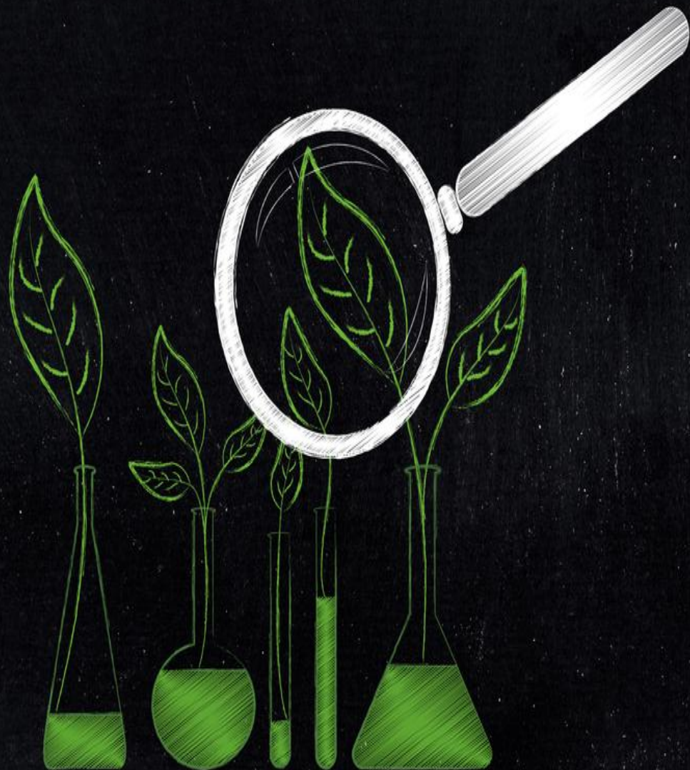
Organic Inspection