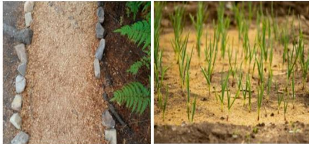
Saw dust mulch