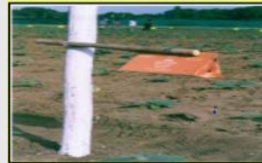
Plastic moth trap