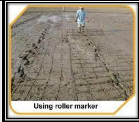
Using roller marker