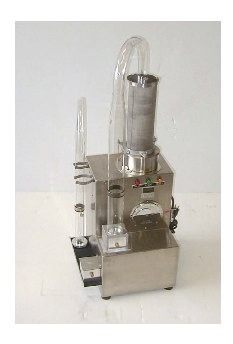
Seed blower for impurity separation