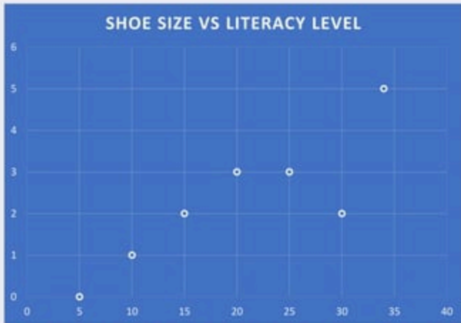
Figure: Scatter plot of Shoe size and Literacy rate