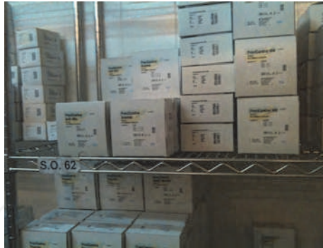
Fig. 4. Storage of the test material in an organized order.