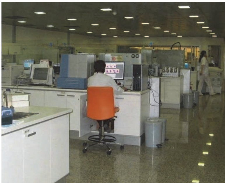
Fig. 1. There should be separate working areas in the laboratory.

have a sufficient and suitable number of rooms or areas to assure the isolation of test systems and the isolation of individual projects, involving substances or organisms known to be or suspected of being biohazardous. There should be storage rooms or areas as needed for supplies and equipment and should provide adequate protection against infestation, contamination, and/or deterioration. Facilities for handling test and reference items should be planned. To prevent contamination or mix-ups, there should be separate rooms or areas for receipt and storage of the test and reference items, and mixing of the test items with a vehicle(Figure 1).