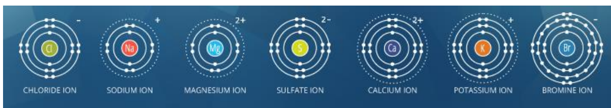
The most common ions in sea water

Salinity is an ambiguous term. As a basic definition, salinity is the total concentration of all dissolved salts in water. These electrolytes form ionic particles as they dissolve, each with a positive and negative charge. As such, salinity is a strong contributor to conductivity. While salinity can be measured by a complete chemical analysis, this method is difficult and time consuming. Seawater cannot simply be evaporated to a dry salt mass measurement as chlorides are lost during the process.