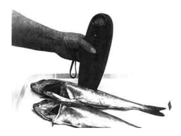
Figure 05 : Physical method

The electrical properties of fish skin and muscle change systematically after death and can be used as the basis of an instrument; a few models are commercially available, including the Torrymeter.