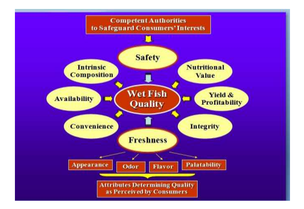
Figure 01: Characteristics quality of wet fish and component authorities to safeguard consumers'interests

Products with quality attributes must ensure safety for consumers through formal systems, such as certification, origin identification, and traceability of production processes. However, consumers are more demanding in terms of their choices, and issues related to food quality are at the forefront regarding consumers' concerns, industry strategies, and in some cases, government policies. Such initiatives should be encouraged considering that fish consumption is associated to health issues, which are the main attributes of interest for consumers. One of the key factors associated to fish consumption is the people's recent interest in health, longevity, and food safety.