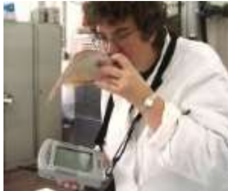
Figure 03: Quality index method

estimation of past and remaining storage time in ice. The descriptions of each score for each parameter are listed in the QIM scheme.