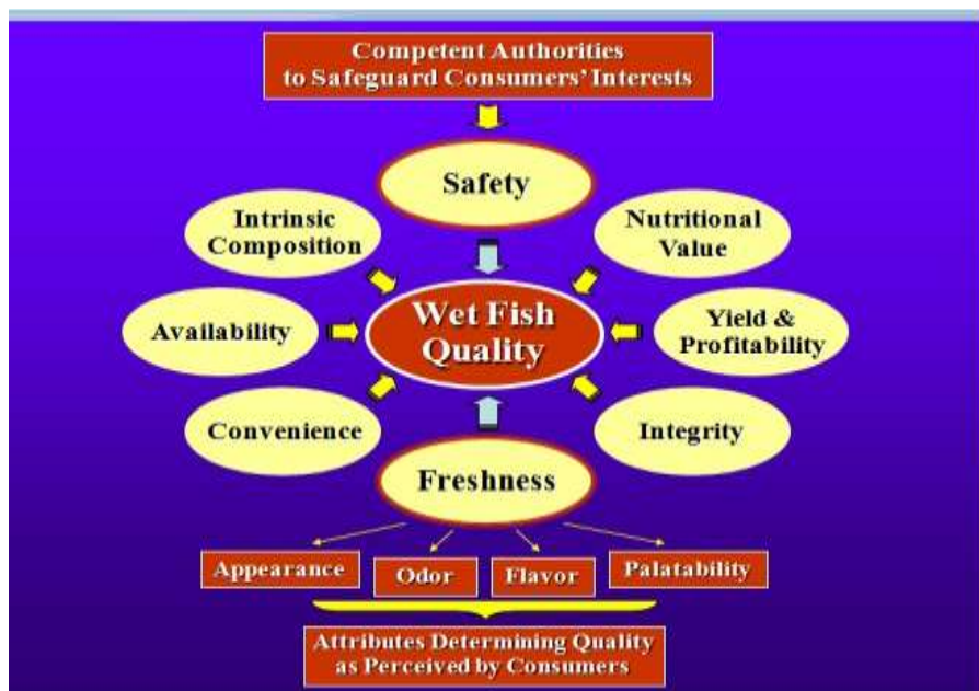
Figure 01: Characteristics quality of wet fish and component authorities to safeguard consumers' interests

Products with quality attributes must ensure safety for consumers through formal systems, such as certification, origin identification, and traceability of production processes. However, consumers are more demanding in terms of their choices, and issues related to food quality are at the forefront regarding consumers' concerns, industry strategies, and in some cases, government policies.. Such initiatives should be encouraged considering that fish consumption is associated to health issues, which are the main attributes of interest for consumers. One of the key factors associated to fish consumption is the people's recent interest in health, longevity, and food safety.