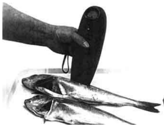
Figure 05 : Physical method

The electrical properties of fish skin and muscle change systematically after death and can be used as the basis of an instrument; a few models are commercially available, including the Torrymeter.