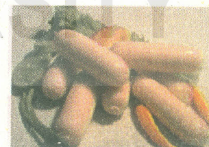
Fig. 21.5: Processed fish sausage.

The ingredients used for sausage preparation are sugar, salt, egg white, chilli, onion, spices nutmeg, starch etc. Sometimes color solution is added to make the sausage attractive. Sorbic acid is the popular preservative for the sausages. More often sausages are eaten without any more processing and in some cases they are further cooked.