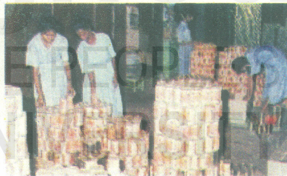
Fig. 21.2: Canned fish can be stored at room temperature without fear of spoilage.

Among the principal demerits, the most important is the weight of the steel container and the filling media. These make the can heavy to transport. Secondly, no single preparation of canned product can suit the taste of a variety of people.