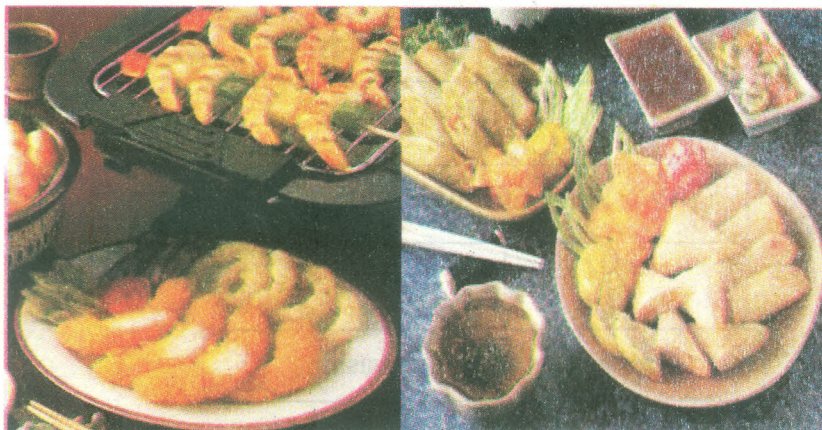
Fig. 21.4: Surimi rolls and samosas.

Surimi is generally graded for its whiteness which should be about 45-60% of levibond whiteness and for gel strength by various methods. One of the methods employs preparation of a tubular roll of the surimi, cutting a thin slice from it and testing for its resistance to penetration by a needle.