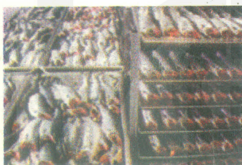
Fig.21.1: Fish trays ready for freezing.

Freezing is done by blowing continuous stream of cold air over the fish. Air is the secondary refrigerant since it is cooled by a primary refrigerant like evaporated liquid ammonia, chlorofluoro carbon (CFC) flowing through the pipes over which air is blown. The rate of cooling depends on the speed of air flow. The speed of air can not be increased indefinitely since it could cause dehydration of the product.