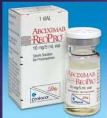
ReoPro – Anticoagulant Monoclonal Antibody(Single Entity CP)