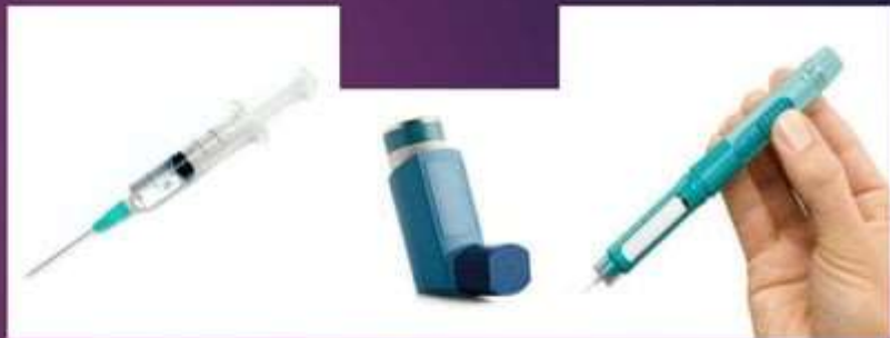
Prefilled DDS(Syringes, insulin injector pen, metered dose inhaler)