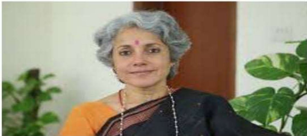
Dr.Soumya swaminathan (Deputy Director General of WHO)