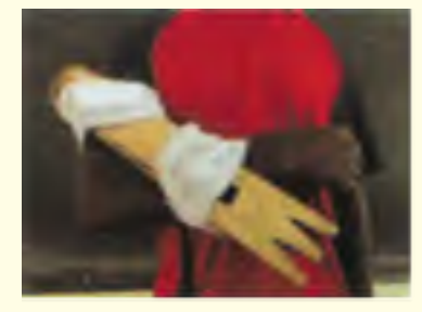
Figure 1: Elbow Bent