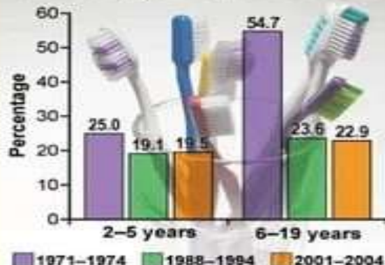
Untreated Dental Caries (Cavities) in Children Ages 2-19, United States