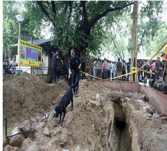
Fig 3 – Crater formed due to the explosion