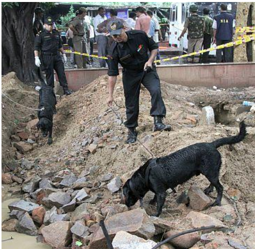
Fig 2 – NIA team on the crime scene