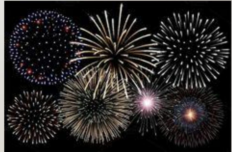
Figure: image of firing crackers