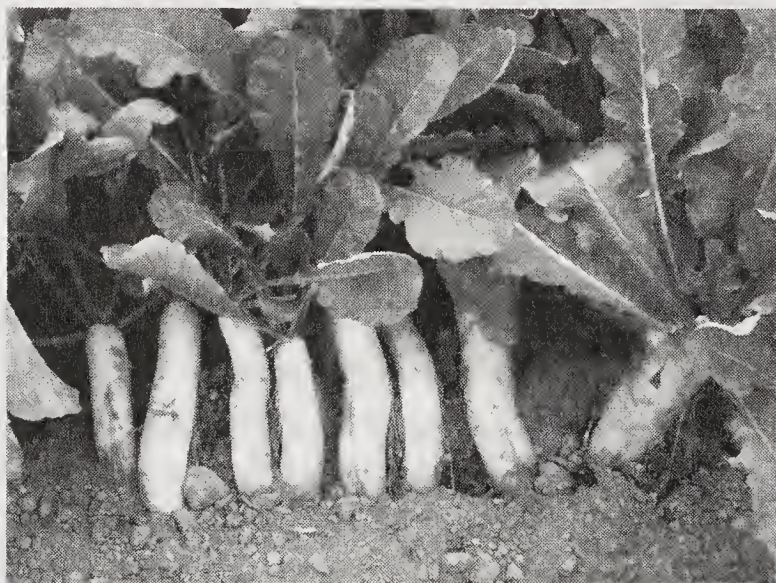
Fig. 14. Radish

Radish is probably originated in Western Asia, was cultivated in ancient Egypt, Greece and Rome. It is now spread through-out the world. In Hindi it is known as mooli . It is grown widely in northern and southern plains as well as in the hills. In India it is grown in an area of 160,000 ha with a production of 2286,000 tonne and productivity of 14.3 tonne/ha (NHB, 2011).