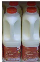
HTST pasteurization Milk heated at 72 °C for 15 seconds, then bottled and refrigerated