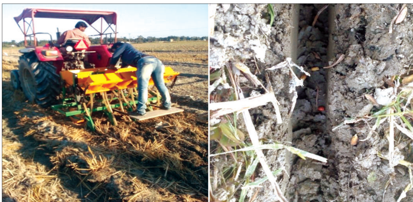
Fig. 1. Zero till fertilizer-cum-seed drill sowing of wheat (left) and opened furrow with placed seed and fertilizer (right)

days). It is almost impossible to sow wheat crop in time after harvesting rice (Table 2). Introduction of zero-till ferti-cum-seed drill in West Bengal during early 2008-09 made it possible to sow wheat timely in freshly harvested untilled paddy fields utilizing the residual soil moisture which not only facilitates the seed germination but also improves the soil fertility and soil physical properties of the wheat field.