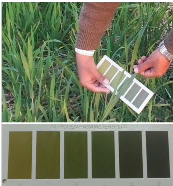
Fig. 3. Wheat LCC (top) and using it in the field condition of UBKV instructional farm (below)

Leaf colour greenness guides in-season need-based fertilizer N top-dressings in wheat. Colour of the top fully exposed leaf is measured from a disease free plant by comparison with different shades of green colour on a LCC in the morning (8:00-10:00 AM) or afternoon (4:00-6:00 PM) under the shade of the body and border rows are skipped at the time of taking observations (Fig. 3). Wheat grain yields were significantly correlated with this technique. A dose of 25 kg N/ha should be applied at planting (i.e. basal). At first irrigation (crown root initiation stage) leaf greenness cannot be quantified properly using LCC due to small leaf size and thus it does not lead to adequate fertilizer N management decision. N application should coincide with crop growth and its requirement. At second irrigation (maximum tillering stage), leaf colour of the first fully exposed disease free leaf served as the best indicator of inherent soil N supply as well as crop N needs and thus helped to guide need-based fertilizer N top-dressing for improving agronomic N use efficiency (ANUE) in wheat. Highest ANUE (26.98) is recorded