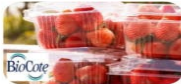
Incorporating directly into the packaging films