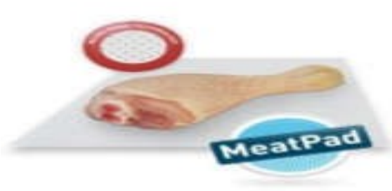
Addition of sachets (pads)