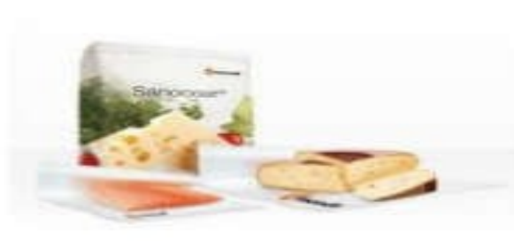
Coating of packaging with a matrix that acts as a carrier for antimicrobial agent